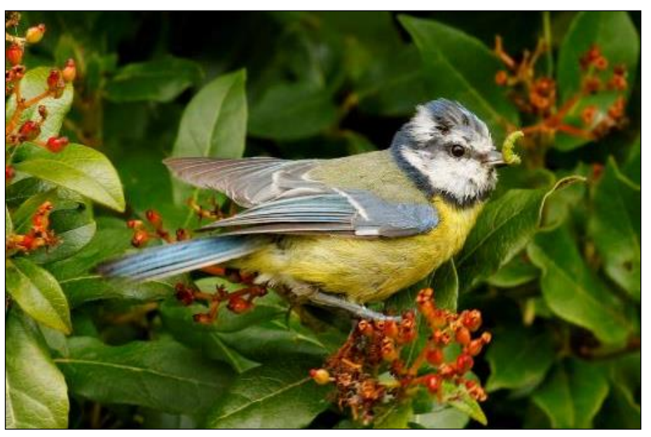
A multi-colored Eurasian Blue Tit with a caterpillar

After lunch, we will visit the Royal Society for the Protection of Birds' Loch Garten Reserve, famous as the site where Ospreys first returned to Britain after an absence of nearly a century. In addition to admiring the breeding Ospreys, we will spend some time watching the feeders, which are frequented by Great Spotted Woodpeckers, Eurasian Siskins, and Great, Eurasian Blue, and Coal Tits: other woodland birds we will be looking for include the Eurasian Treecreeper, Spotted Flycatcher, Chiffchaff. and These ancient Caledonian pines and bogs are the only site in Britain where the very rare Capercaillie Eurasian and Crested Tit occur; another of our