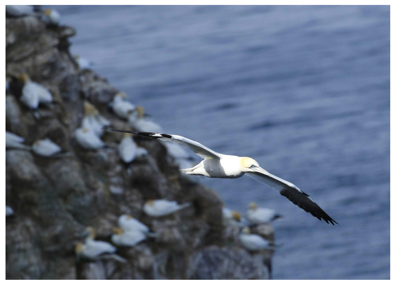
A Northern Gannet at Troup Head RSPB Nature Reserve