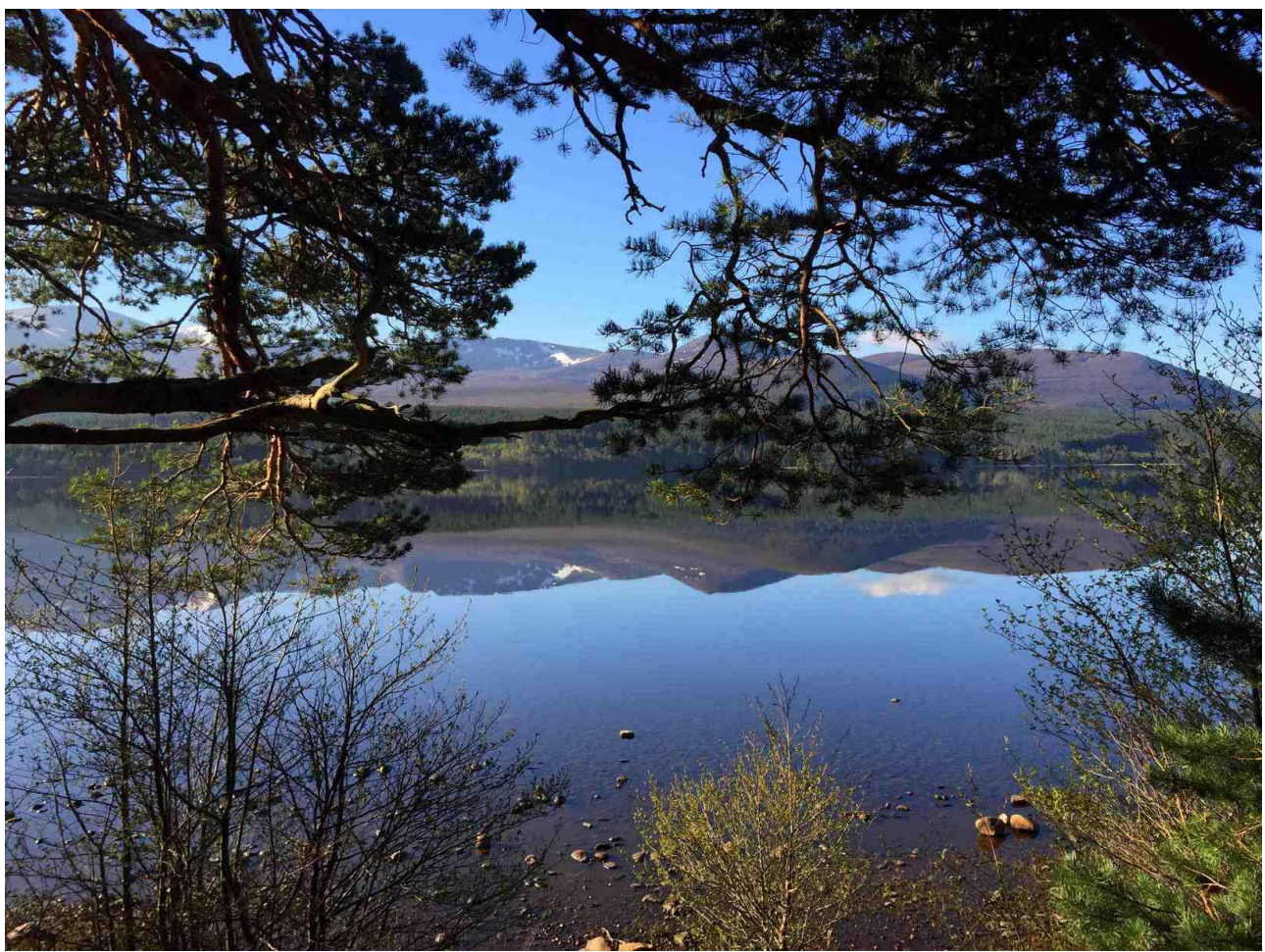
Cairngorms National Park

Based in a single historic hotel, our short tour provides a delicious taste of the enormously varied natural and cultural offerings of the Scottish Highlands. During eight full days around Strathspey and the spectacular Cairngorms National Park, our excursions will focus not only on the excellent