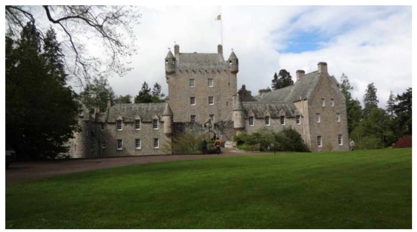
Cawdor Castle and its forested grounds

<u>May 16, Day 7: Findhorn Bay, Nairn & Cawdor Castle</u>. The extensive mudflats, saltmarshes, and shore of Findhorn Bay and Nairn are at their best when the water is closest to the shore, and we'll plan today's visit for high tide, hoping to see flocks of Pink-footed Geese, Eurasian Wigeons, Bar-tailed Godwits, Whimbrels, and Common Ringed Plovers among the many birds likely to be feeding here.