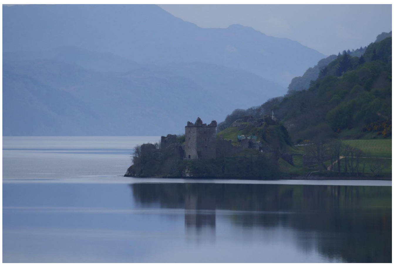
The famous Urquhart Castle and mysterious Loch Ness

After lunch, we'll visit famous Urquhart Castle, a romantic ruin perched improbably atop an irregular stony outcrop. The castle is surrounded on three sides by the even more famous Loch Ness, and visitors from around the world come here in hopes that the 600-foot-deep waters might suddenly ripple and part, to reveal something completely unknown to science emerging to confound a sceptical world. Access to the loch otherwise is relatively difficult, so the fine view from the stunning ruins of Urquhart Castle makes it even more of an attraction.