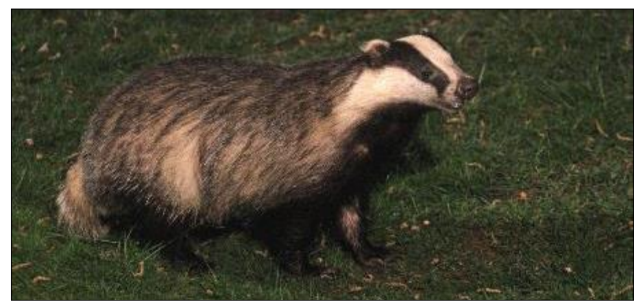
European Badger— a highlight on our mammal dusk trip

If possible—operating dates vary from year to year, and even in spring, the weather is an unpredictable factor we will ride Scotland's only funicular railway to an elevation of some 3600 feet. The 1.5-mile trip takes about eight minutes, and deposits us at the aptly named Ptarmigan Restaurant. Some of us may wish to enjoy the view from here; with special permits in hand, the rest of us will venture forth on an hour's walk on gravel paths across the alpine tundra, the summer home of Rock Ptarmigan, Snow Buntings, and Eurasian Dotterels.