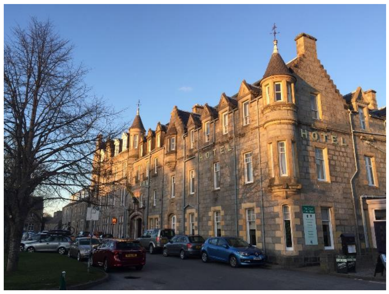
A lovely sunset on our fabulous Grant Arms Hotel

<u>May 12, Day 3: Anagach Woods, Black Isle, and Chanonry Point</u>. Our hotel is adjacent to the pine forests of Anagach Woods, where the hotel staff maintains bird feeders. Among the birds we can hope to find here on our first pre-breakfast birding walk include Crested and Coal Tits, Eurasian Siskins, and Eurasian Treecreepers, and this is also a fine place to look for the diminutive Roe Deer.