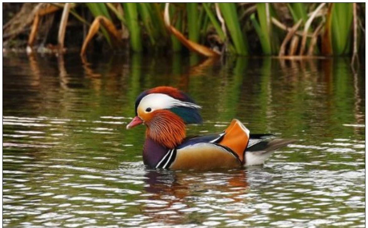
A male Mandarin Duck in all its full glory

NIGHT: The Grant Arms Hotel, Grantown-on-Spey