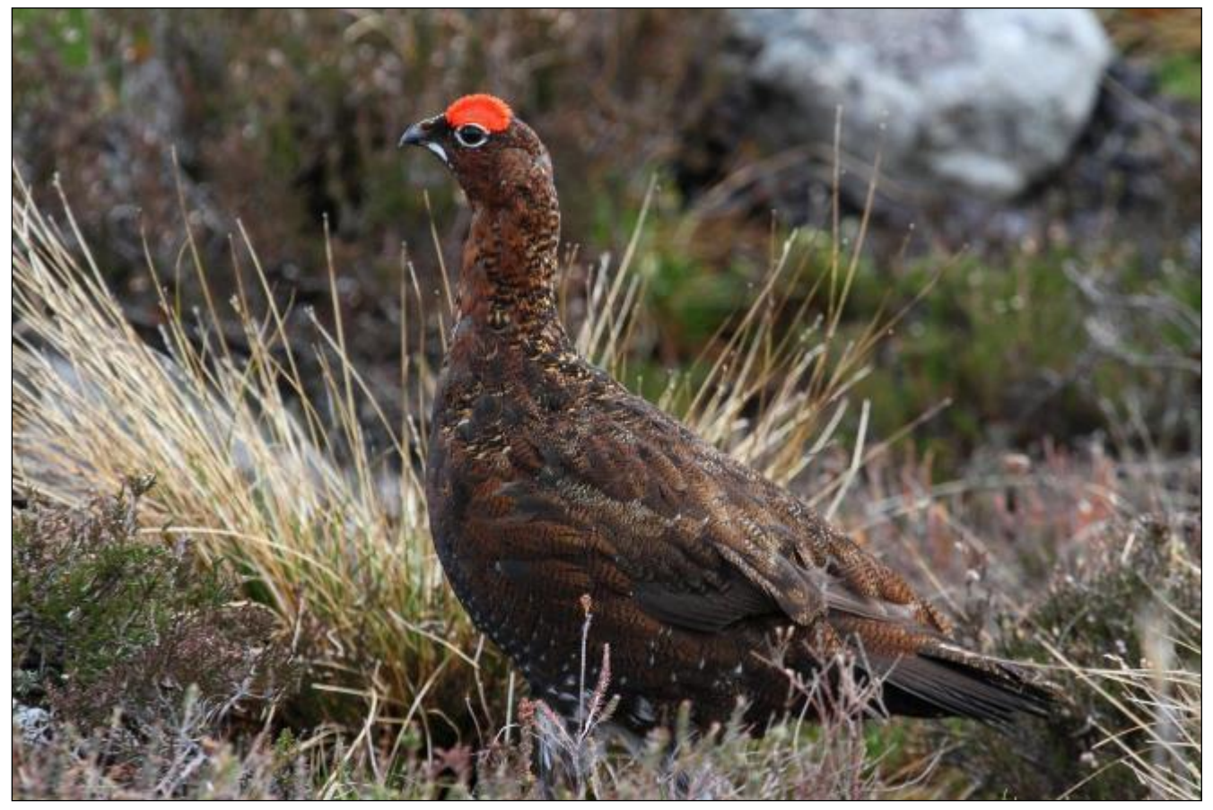
The distinctive local race of the Willow Ptarmigan, the Red Grouse

<u>May 10, Day 1: Travel to Inverness, Scotland</u>. Most transatlantic flights from the United States depart in the late afternoon or evening and arrive the following morning at a European hub city with connections to Inverness Airport (airport code INV).