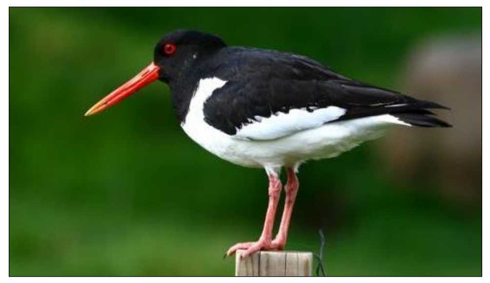
Eurasian Oystercatchers are common breeders in fields.

<u>May 16, Day 7: Findhorn Bay, Nairn & Cawdor Castle</u>. The extensive mudflats, saltmarshes, and shore of Findhorn Bay and Nairn are at their best when the water is closest to the shore, and we'll plan today's visit for high tide, hoping to see flocks of Pink-footed Geese, Eurasian Wigeons, Bar-tailed Godwits, Whimbrels, and Common Ringed Plovers among the many birds likely to be feeding here.