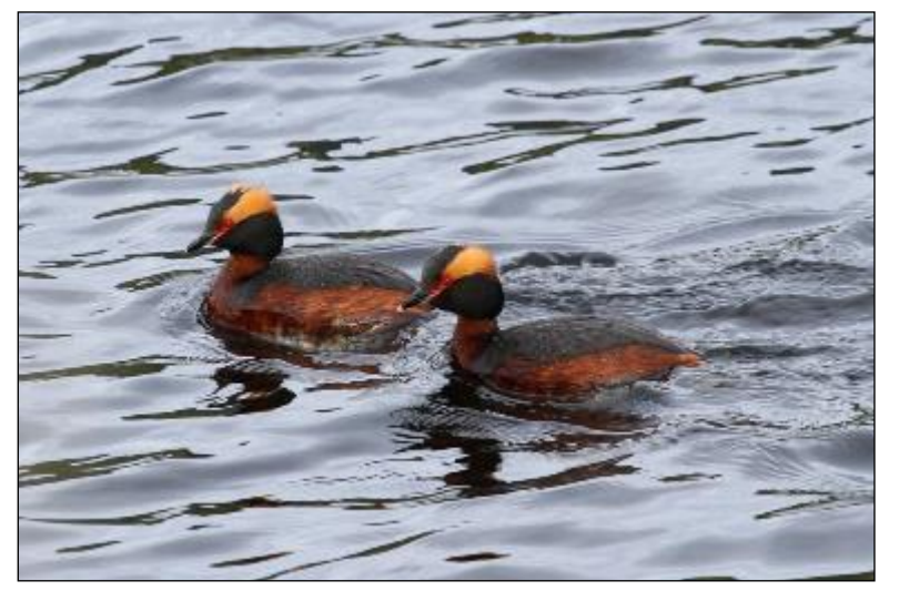
Horned (Slavonian) Grebes in their marvellous breeding dress

After this morning's early start, we will try to plan in a bit more "down time" than usual in the afternoon before gathering for another convivial evening meal together.